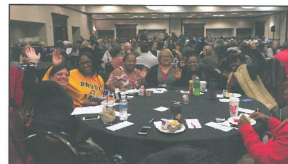
CTU teachers enjoy the 2017 Enspire Conference, a creativity workshop that expands entrepreneurship education and activities into their classrooms.