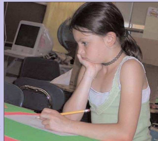
A pre-pilot infusing Junior Achievement lessons with Camp Invention goals was tested in Hudson last summer. This student works on a marketing plan.