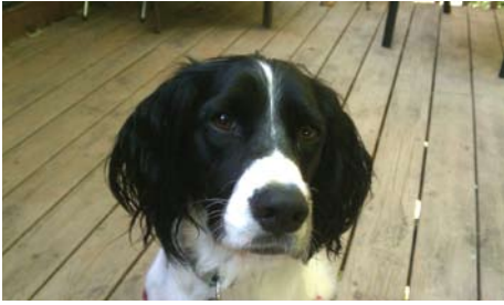
Ladybug Hoover and Oscar Frank.